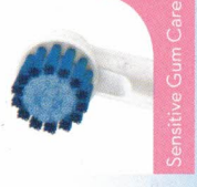
Sensitive Gum Care